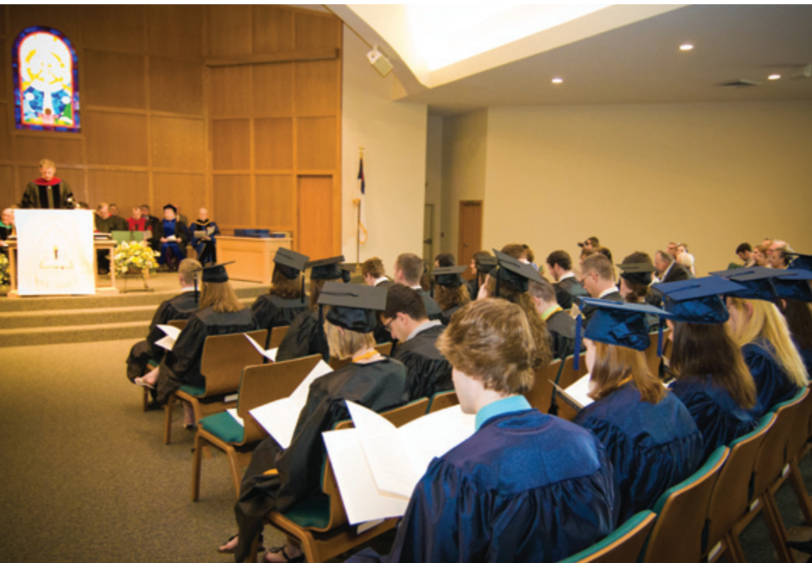
2011 Grace Bible College Commencement Frontline Bible Church